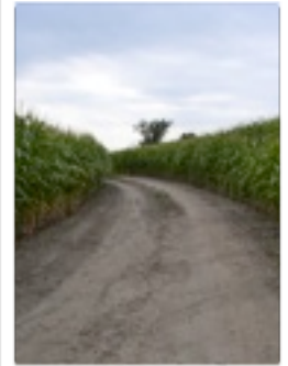
Interesting images of Wright County